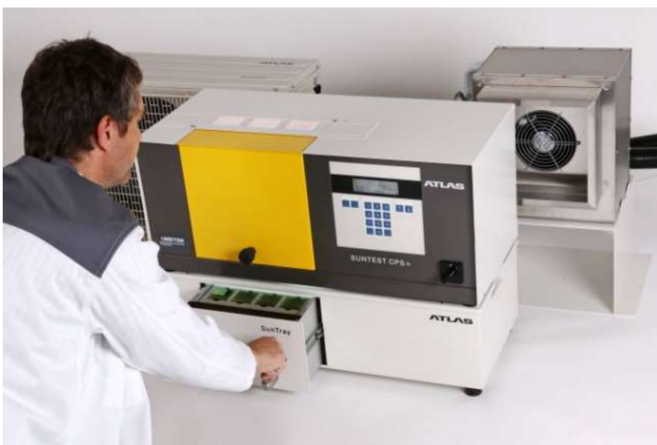
Figure 3: In vitro UVA test setup with SUNTEST CPS+, SunCool and SunTray accessories

The test temperature between 25-35 °C are controlled even at highest SUNTEST irradiance settings by a refrigeration unit called SunCool which feeds in chilled air. To complete the ideal test setup, there is a specimen handling accessory named SunTray (Figure 3). The SunTray is a sample exchanger unit underneath the SUNTEST and includes a holder for 8 standard PMMA plates. It allows for fast and safe exchanging of samples during the SUNTEST in continuous light mode. It's both practical and the continuous light mode takes care of the SUNTEST xenon lamp which would suffer from frequent ON/OFF switches caused by short UVA test durations of a few minutes.