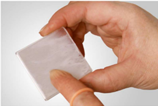
Figure 1: Image Courtesy Labsphere Corp

The in vitro test methods of both COLIPA (2011) and ISO 24443 are based on the measurement of UV radiation transmittance through a thin film of sunscreen which is manually applied to a special PMMA plate (Figure 1) of defined size and, quality and surface roughness [2] [3] . The UV transmittance characteristic of the sunscreen is measured with a Spectrophotometer before exposure to a UV radiation source and after.