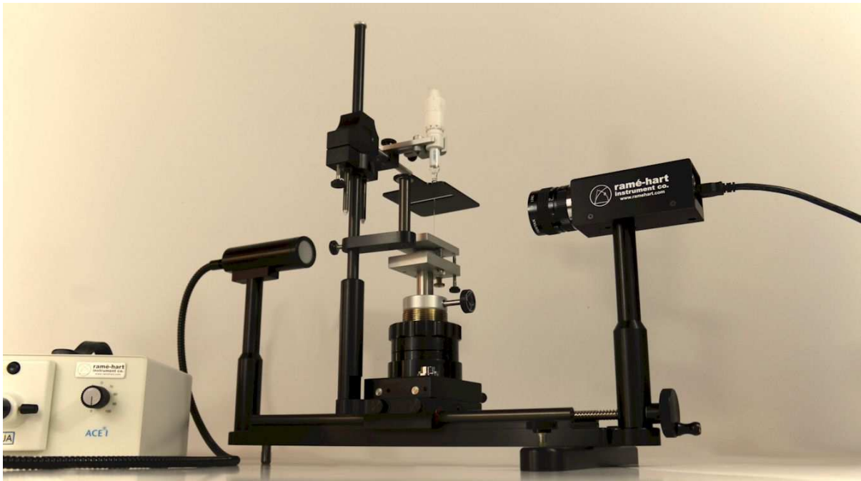
Model 500 Advanced Goniometer / Tensiometer