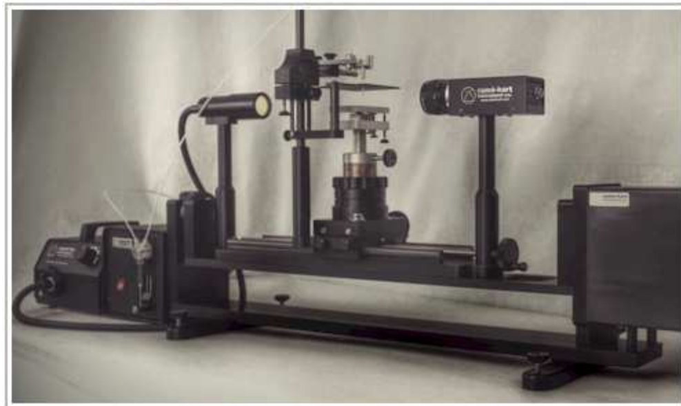
Model 590 Advanced Automated Goniometer / Tensiometer