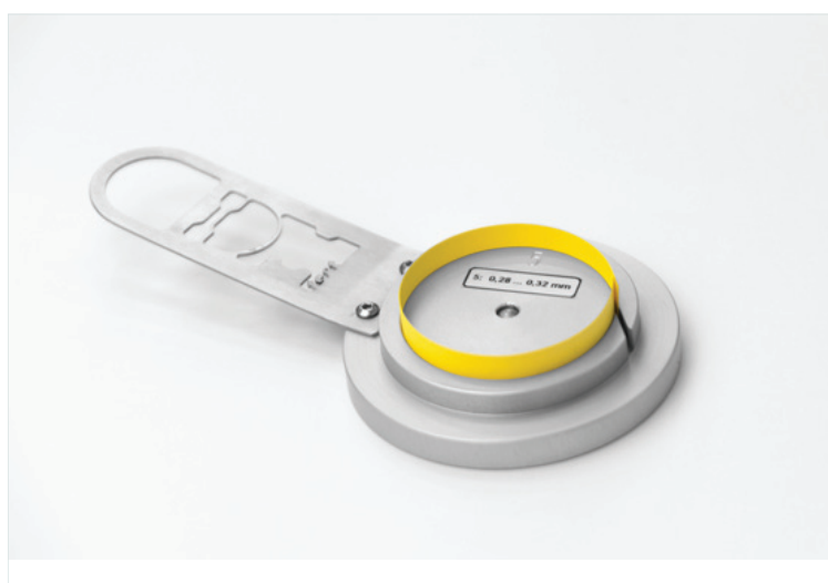
Figure: Ring Crush Test (RCT)