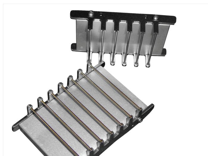
Figure: Pin Adhesive Test (PAT)