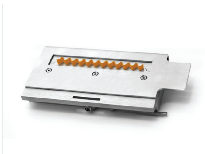
Figure: Concora Crush Test (CCT)