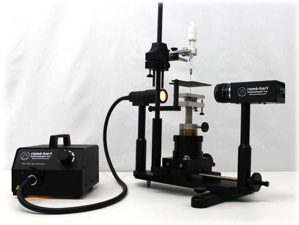
Model 260 Goniometer / Tensiometer