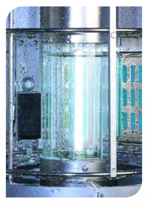
BST Control on Sample Rack, Integrated Specimen Spray System

The irradiance and Black Standard Temperature (BST) is on-rack controlled by a wireless XENOSENSIV light and BST monitor. This ensures accurate conditions on the sample level.