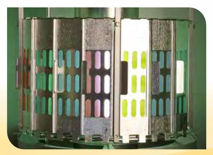
SEPAP MHE Specimen Rack

To simulate the effects of water, the SEPAP MHE+ is equipped with a specimen spray system.