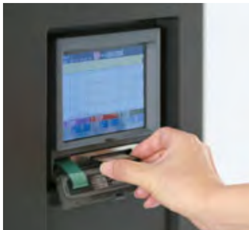
Paperless recorder (optional)